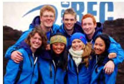
2009/2010 UBC REC Public Relations Department

Getting involved with REC is not limited to volunteering; there are several paid student positions available throughout the year. If you have a passion for customer service and like working in a fast paced environment, UBC REC Operations staff handle all of the in-person registration and administer the drop in program. If sports are your thing, a variety of referee and officials positions are available during the school year for our leagues and tournaments. Additionally, our instructional classes and outdoor rec program would not be possible without our skilled instructors and outdoor program leaders. With programs ranging from yoga to martial arts to hiking or trail running, if you have a passion or skill for any of these things, UBC REC is a great place to get involved with the UBC Community.