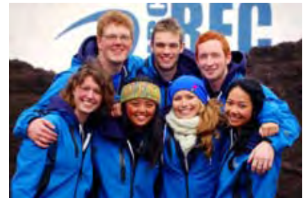
2009/2010 UBC REC Public Relations Department

Getting involved with REC is not limited to volunteering; there are several paid student positions available throughout the year. If you have a passion for customer service and like working in a fast paced environment, UBC REC Operations staff handle all of the in-person registration and administer the drop in program. If sports are your thing, a variety of referee and officials positions are available during the school year for our leagues and tournaments. Additionally, our instructional classes and outdoor rec program would not be possible without our skilled instructors and outdoor program leaders. With programs ranging from yoga to martial arts to hiking or trail running, if you have a passion or skill for any of these things, UBC REC is a great place to get involved with the UBC Community.