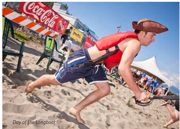
Day of the Longboat