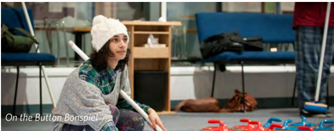
On the Button Bonspiel