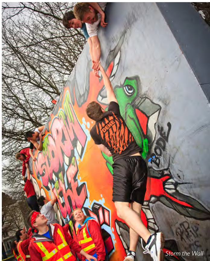
Storm the Wall