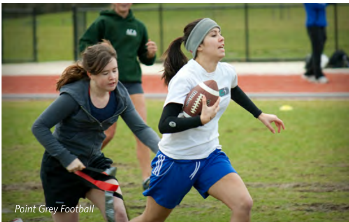
Point Grey Football