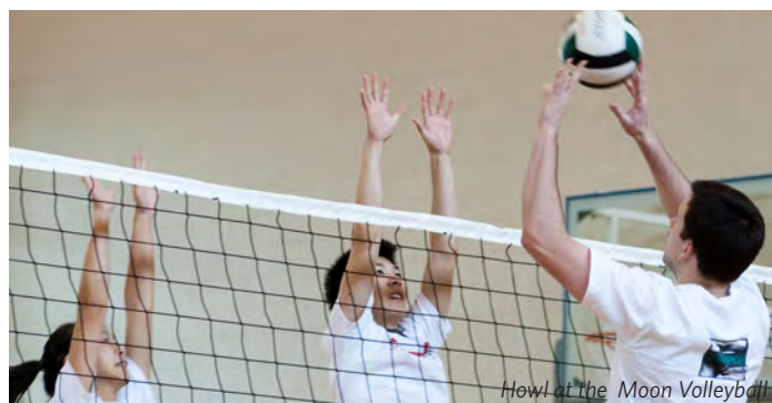
Howl at the Moon Volleyball