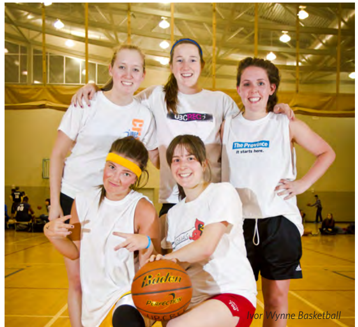
Ivor Wynne Basketball

All prices are team rates unless otherwise listed and include applicable taxes.