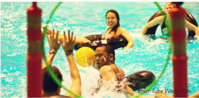
Inner Tube Water Polo