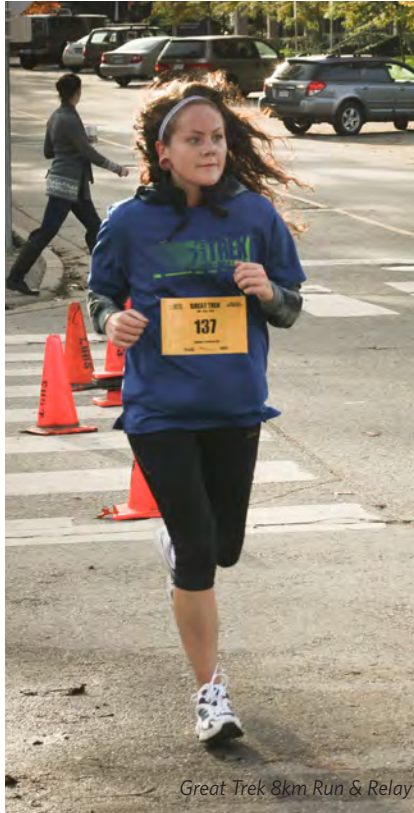
Great Trek 8km Run & Relay