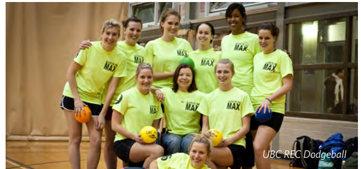
UBC REC Dodgeball