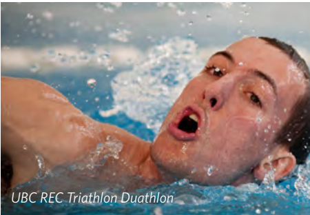
UBC REC Triathlon Duathlon