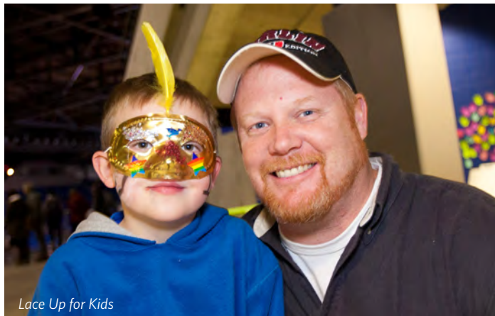
Lace Up for Kids

Reg by Nov 17 Waiver & Roster Add/Drop by Nov 23