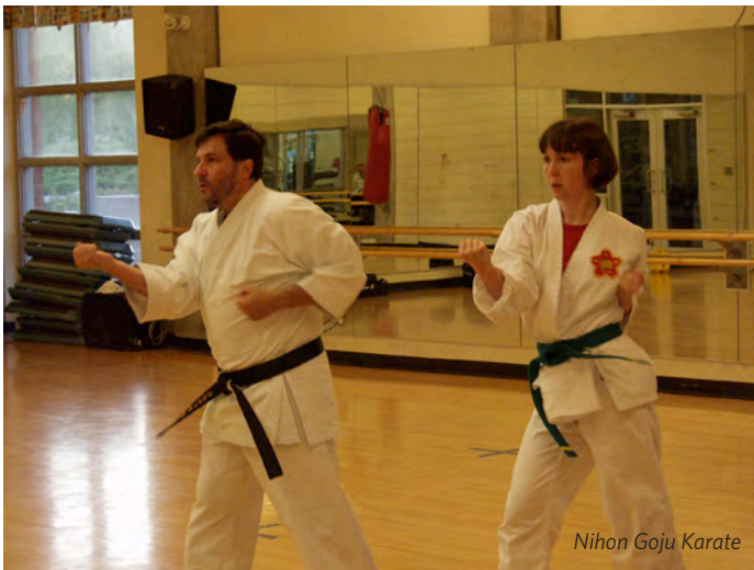
Nihon Goju Karate