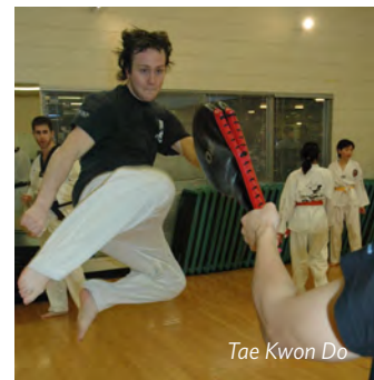
Tae Kwon Do